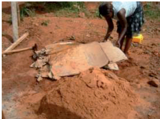
Take off leaves from potato vines and mash in water. Sieve the mixture of sand and soil. Mix this water into the soil/sand mixture – trample it in with your feet, so that it is all thoroughly mixed well together.