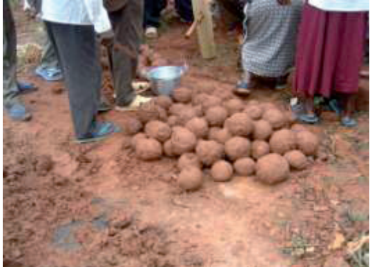
Form into large balls.

Throw down onto floor over banana stem which forms what will be the hole into the stove, where you will put the sticks.