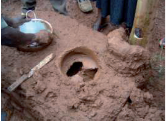
Wrap some of the potato vines with the mixture to form the chimney. Shape as required.