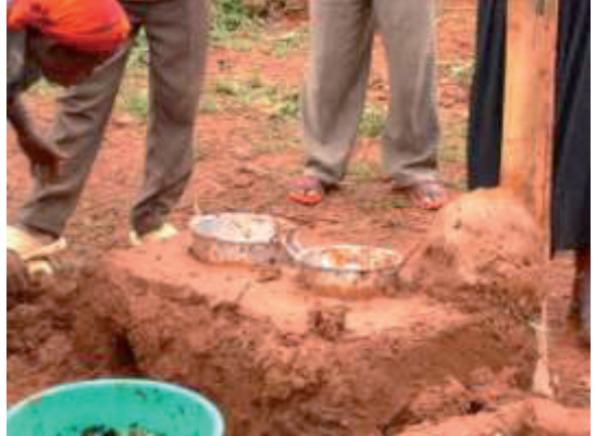
Your new stove will be very much more efficient than a normal open fire because it will use far less fuel. If you look after it, it should last you about 10 years.