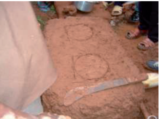
Continue to form the stove, scooping out the mud from inside the stove,