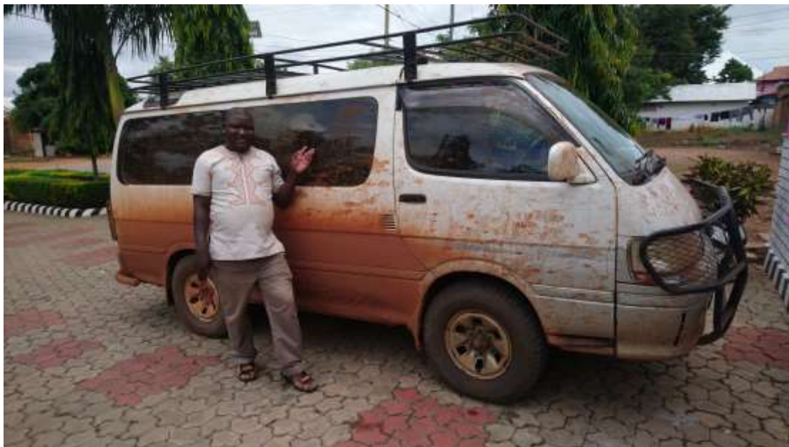
CBM(U) teaching in Tanzania